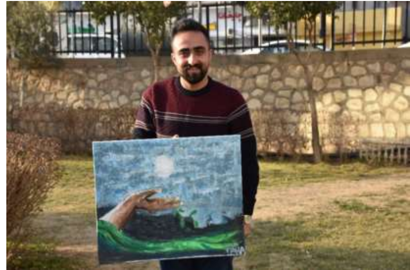
In Dohuk, a “peace through art” initiative is bringing together youth from host community, Syrian refugees and IDPs to promote coexistence and heal trauma.