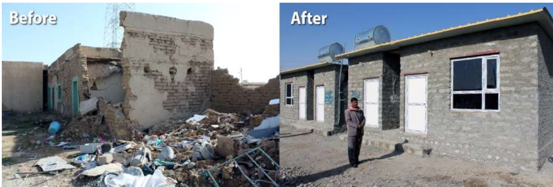
In Hardan town, Ninewah, a total of 500 damaged houses will be rehabilitated in Sinuni encouraging return of approximately 3,000 people.